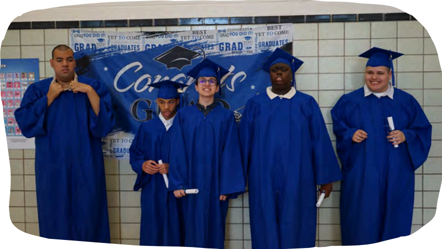
Sawtelle Learning Center