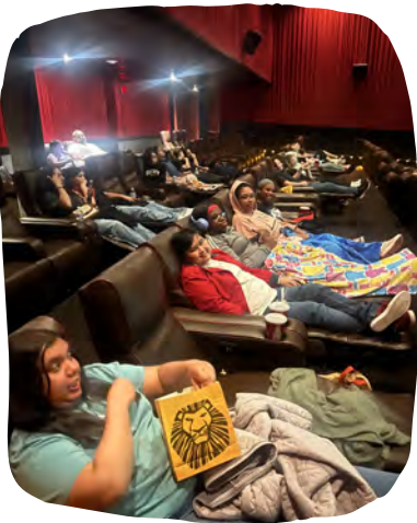
Trip to the movies to see "Michael"