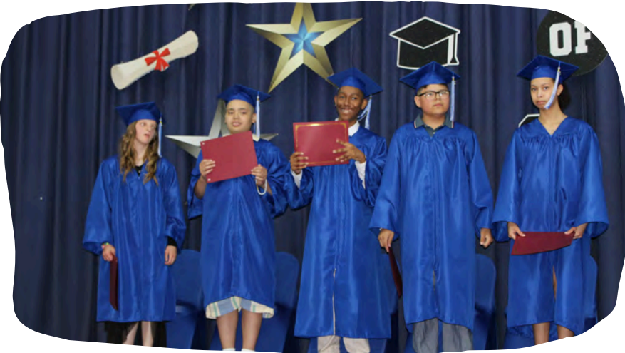
George Washington School