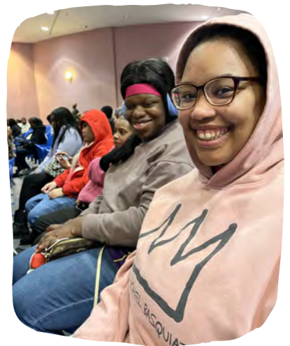
East Orange Campus invited Buffalo ladies to attend the spring music festival.